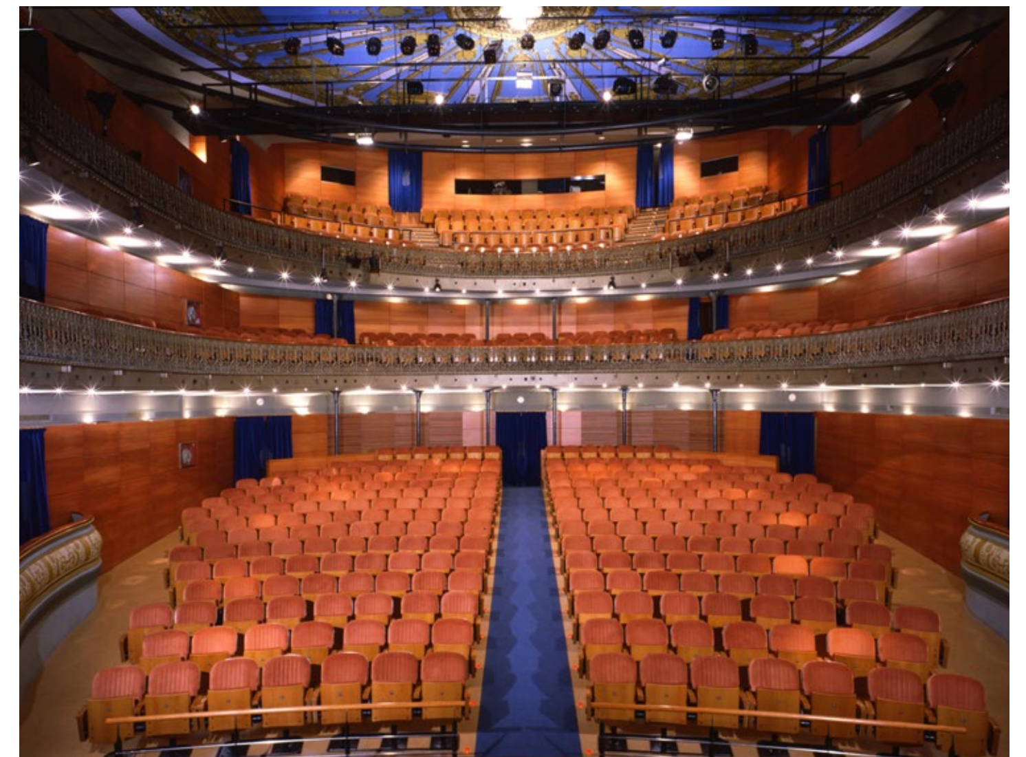
The Romea Theatre, before its recent renovation, was already equipped by Figueras in 2001.

On this occasion, the theatre management chose to preserve the essence by conserving the seat design while updating the design and materials. The seat is upholstered in red velvet made from recycled material, moving away from the previous color scheme. Both the backrest and seat feature quilted stitching with vertical seams for a padded and comfortable look. The seat folds automatically via a mechanism operated by a double lateral hinge, which now includes a new safety return system. Both the seat and backrest are covered with beech wood, treated with flame-retardant varnish and finished in cherry color. The side panels