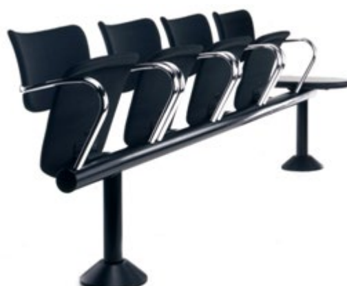
Delta FS 433